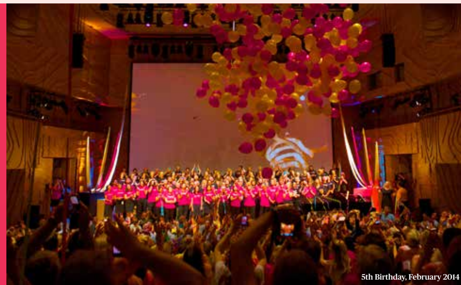
5th Birthday, February 2014