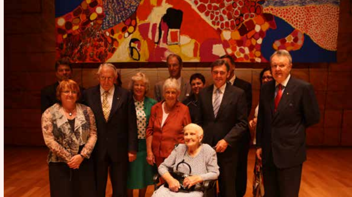
Official opening February 2009 – benefactors, government and board members with the Late Dame Elisabeth Murdoch AC DBE